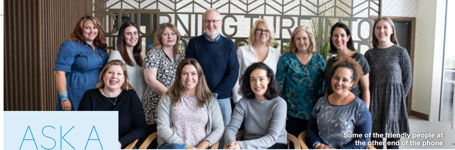
Some of the friendly people at the other end of the phone